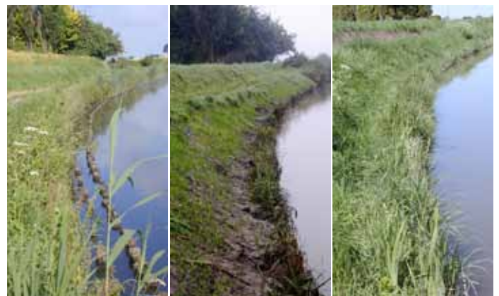
Aqualogs used as soft engineering bank protection.