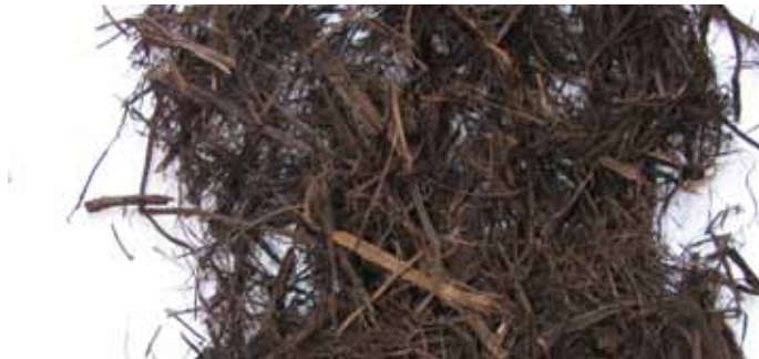
Xylit fibres filter silt, binds nutrients and improves water quality.

Aqualogs provide a tougher more durable alternative to coir rolls whilst still using natural fibres. They have a design life of >30 years in the aquatic environment.