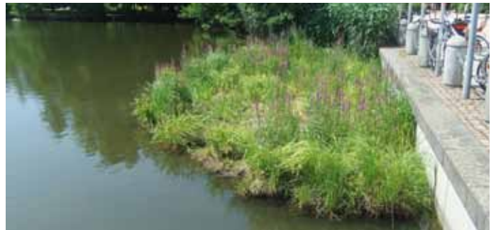
Soft bank protection promotes plant establishment.

Aqualogs filter nutrients from surface water, binding them to the fibres to improve water quality and making nutrients available for plants.