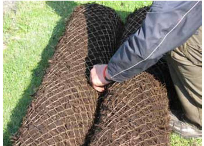
Aqualogs available in 2*0.2 m.

Xylit fibre is extremely robust and elastic, it is able to withstand mechanical stress and biological degradation.